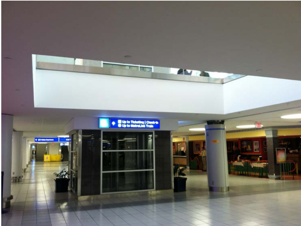
Fig. 1: Atrium from lower level, looking at elevator bay.