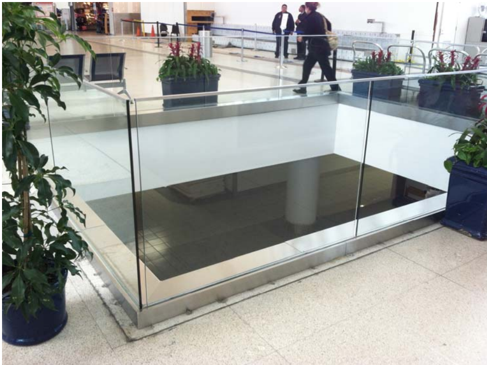
Fig. 4: Atrium from upper level.