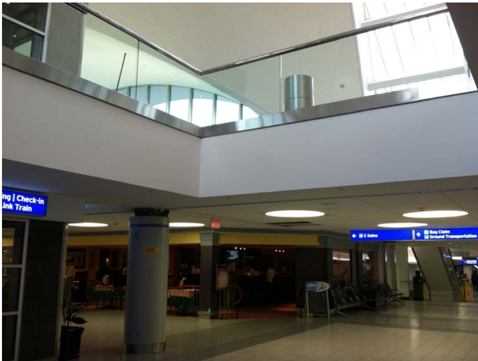
Fig. 2: Atrium from lower level, with view to upper level.