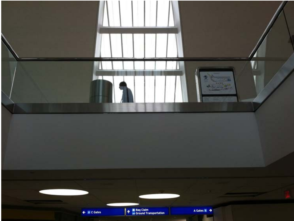
Fig. 3: Atrium from lower level, with view to upper level skylight.