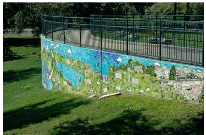
Deep Eddy Mural Project, 2011