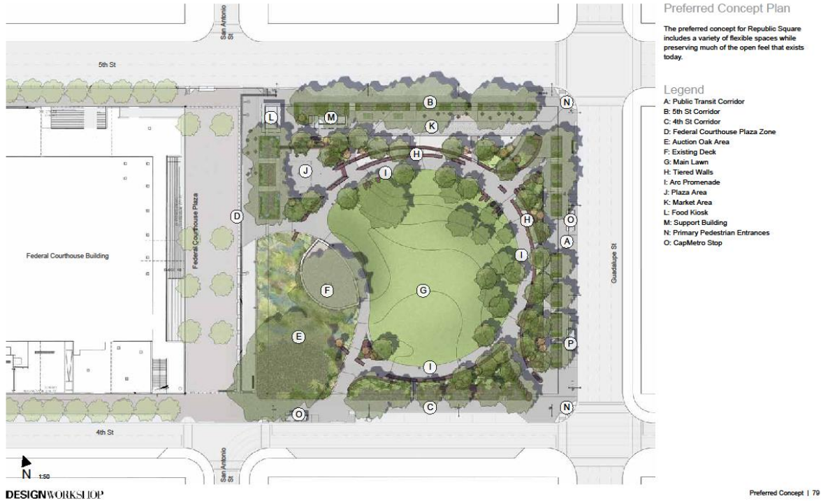
Preferred Concept Plan Site map

the partnership agreement in the public interest. More information on the Master Plan can be found at http://www.austintexas.gov/department/parks-and-recreation/projects .