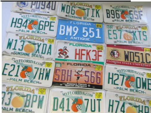
Confiscated License Plates