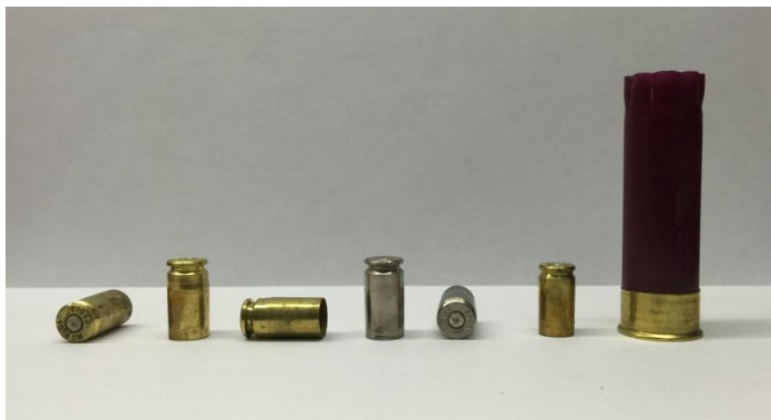
Brass Bullet Casings, From Sherriff Training Shooting Range