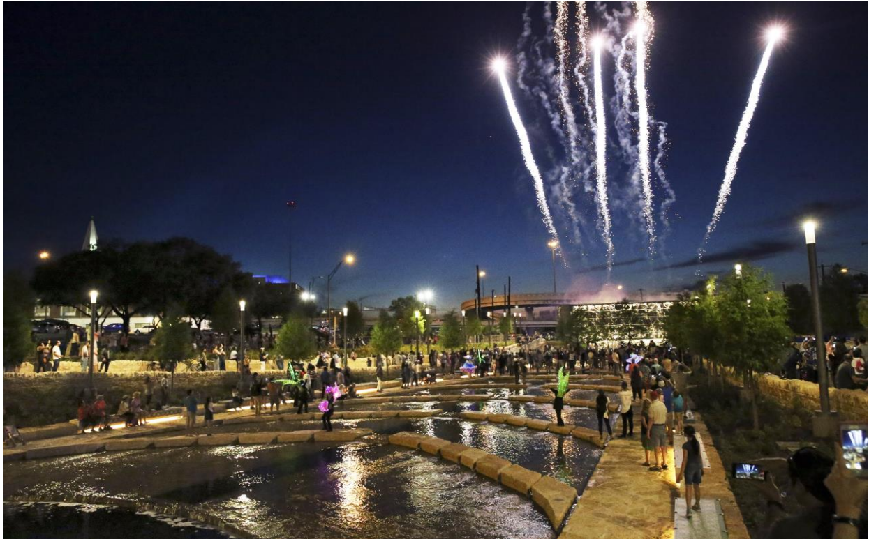
San Pedro Creek Culture Park Grand Opening (Phase 1.1), May 5, 2018 View of Plaza de Fundacion (artwork location not in view)