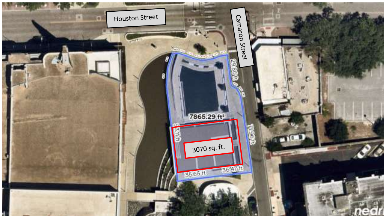
Aerial view with dimensions of the St. James AMEC Culture Crossing site (the red portion portrays the archaeological footprint's dimensions)