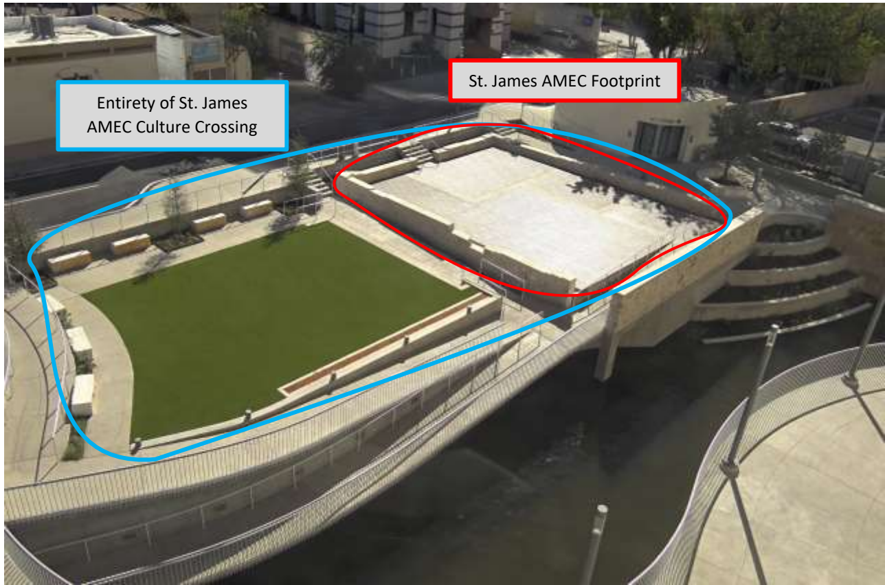
San Pedro Creek Culture Park, Phase 1.2, St. James AMEC Culture Crossing View from upper paseo/walkway, across the creek, looking south east