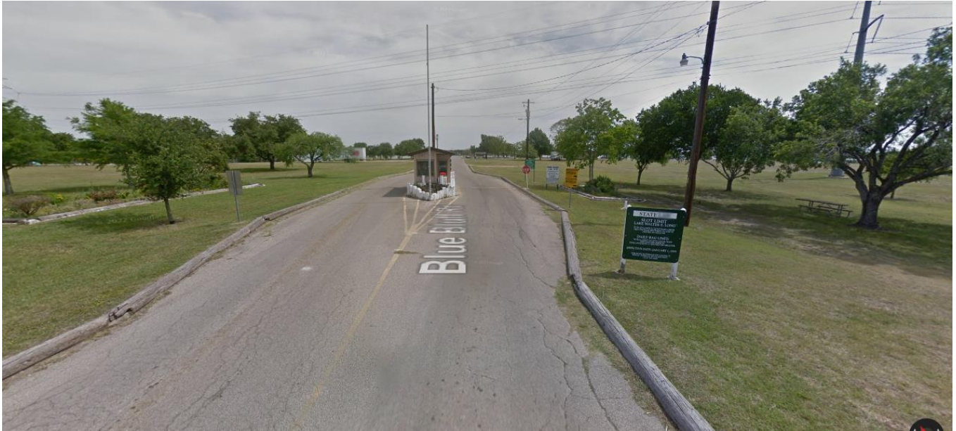
(Pictured: entrance to the Walter E. Long Metro Park)