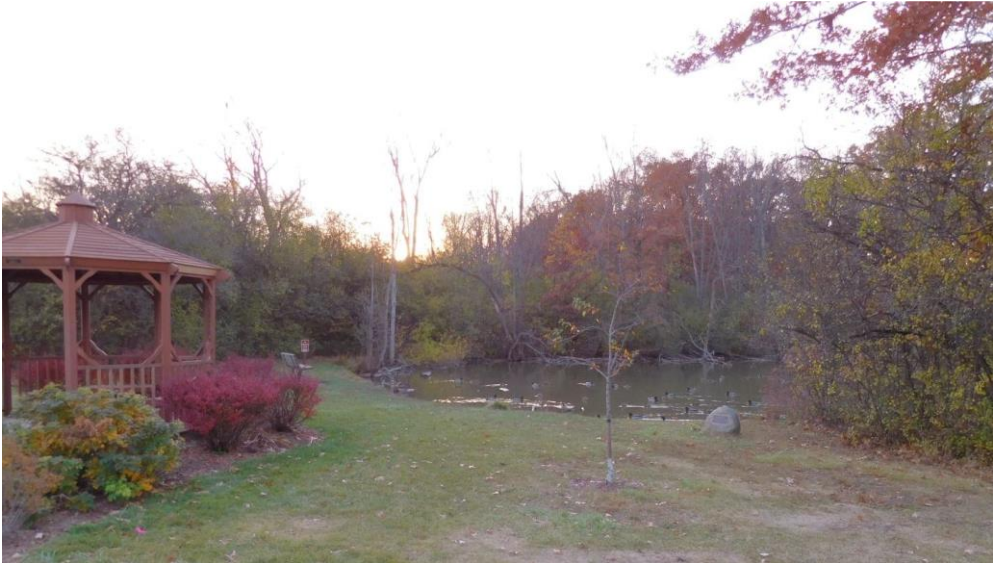
POND AREA: BEVERLY PARK