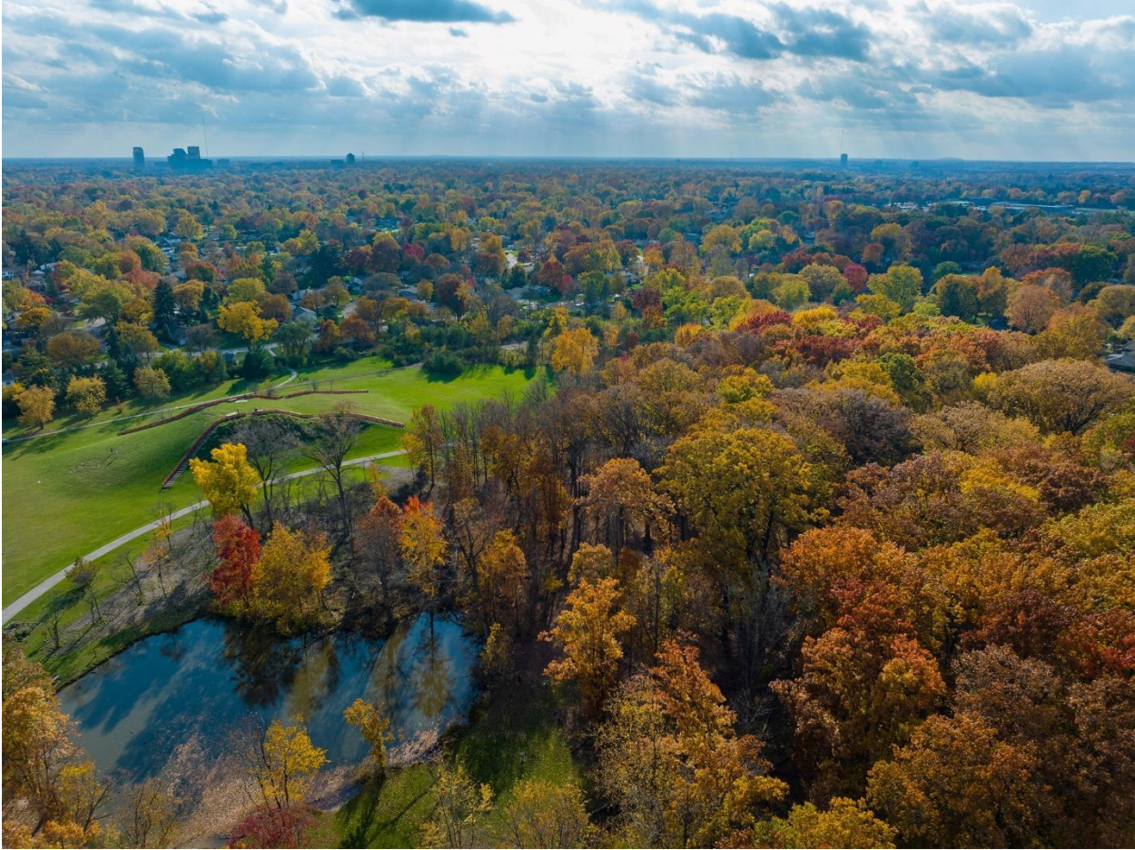
AERIAL VIEW OF BEVERLY PARK