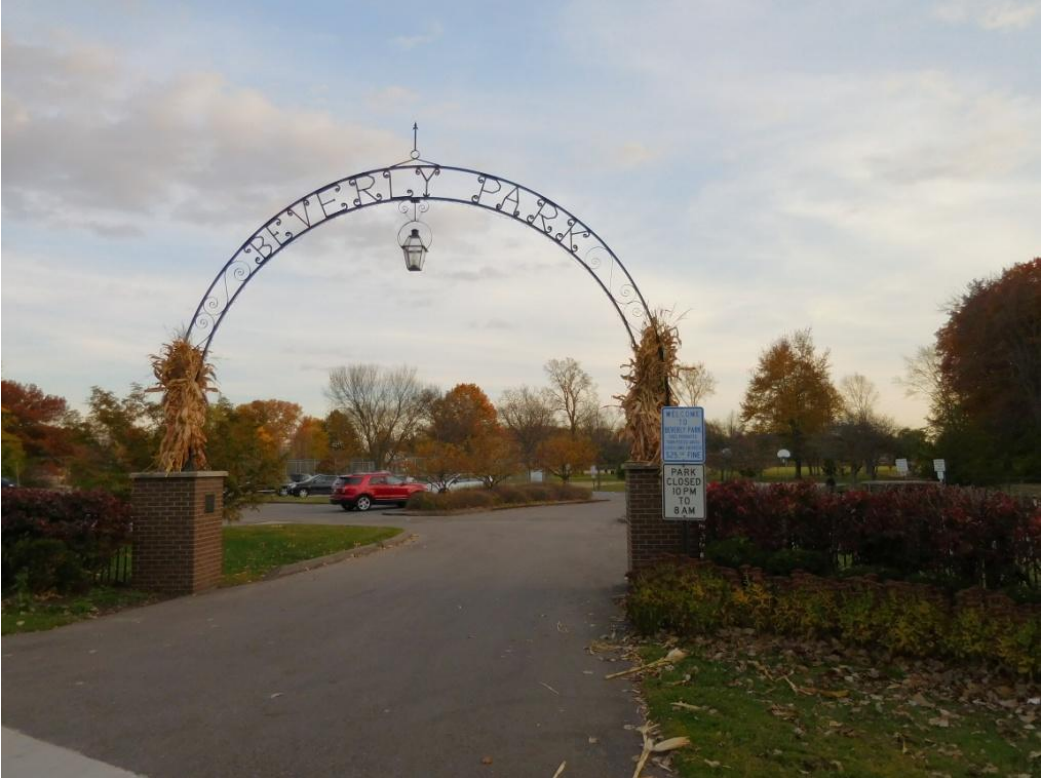
BEVERLY PARK ENTRANCE