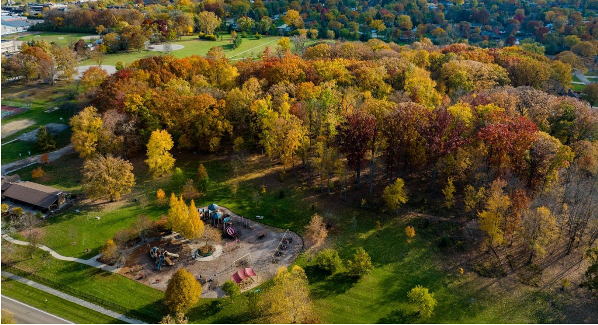
AERIAL VIEW OF BEVERLY PARK