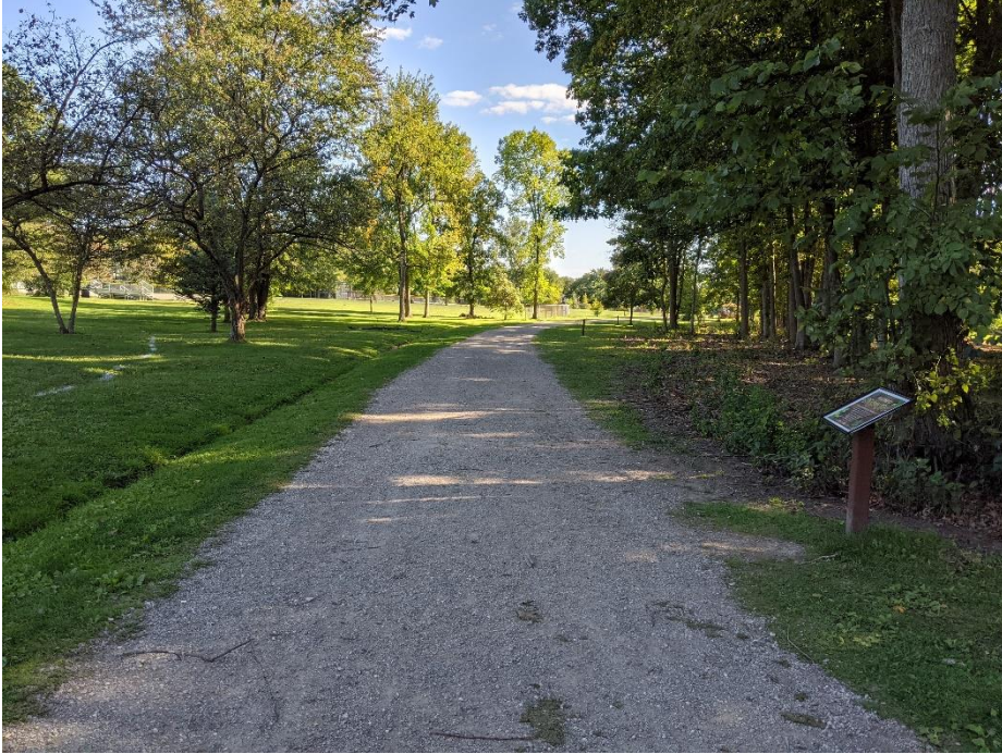
WALKING TRAIL AT BEVERLY PARK