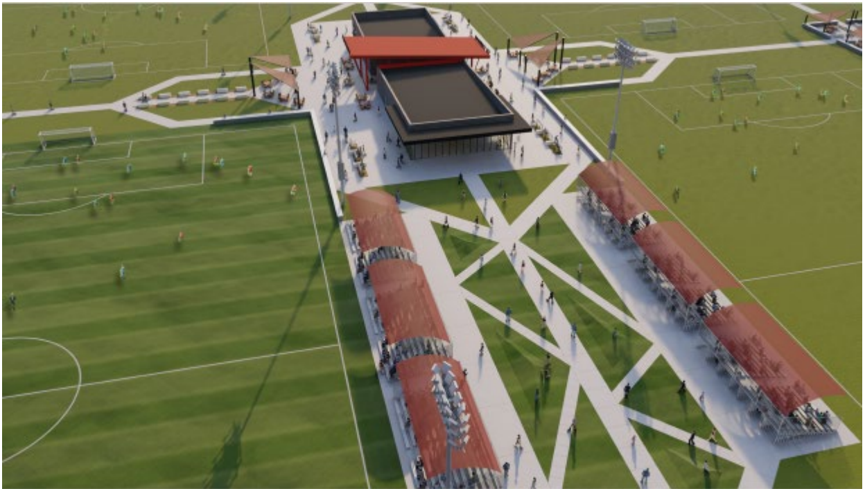
CB CAMERON PARK IMPROVEMENTS MAPS 4 - M4-NPS11 CENTRAL PLAZA AREA OKLAHOMA CITY, OKLAHOMA OCTOBER 2024